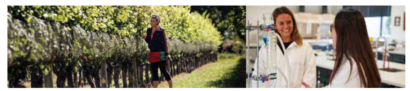
On-site vineyard from which our students can make their own wine.