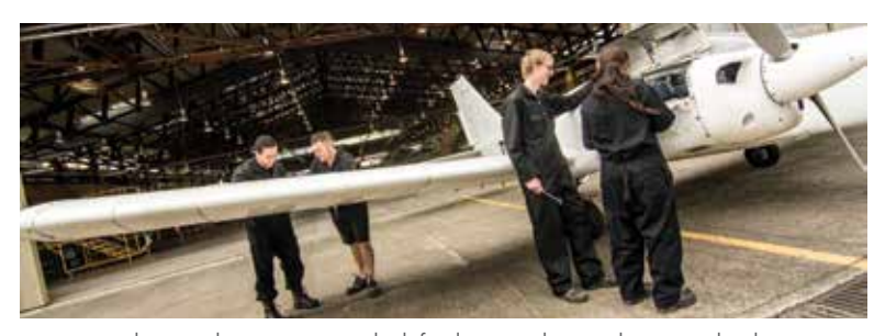
Aviation students study in our purpose built facilities, on the Royal New Zealand Air Force Base in Woodbourne.